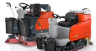
Tool "Light-debris collector" – option for Scrubmaster B175 R, B260 R and B400 R, and Sweepmaster 900 R and 980 R/RH

Hako GmbH Hamburger Str. 209-239 23843 Bad Oldesloe Tel. +49 (0) 4531-806 0 info@hako.com www.hako.com