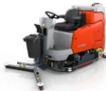
Pre-sweep tool "Broom" – option for Scrubmaster B175 R, B260 R and B400 R