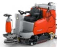
Scrubmaster B5 holder – option for Scrubmaster B175 R, B260 R and B400 R and Sweepmaster 980 R/RH