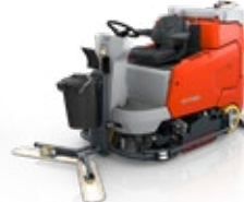
Pre-sweep tool "Mop" – option for Scrubmaster B175 R, B260 R and B400 R