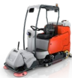
Pre-sweep/vacuum unit with Dust Stop – option for low-dust sweeping and reduced fine particulate development for Scrubmaster B175 R and B260 R